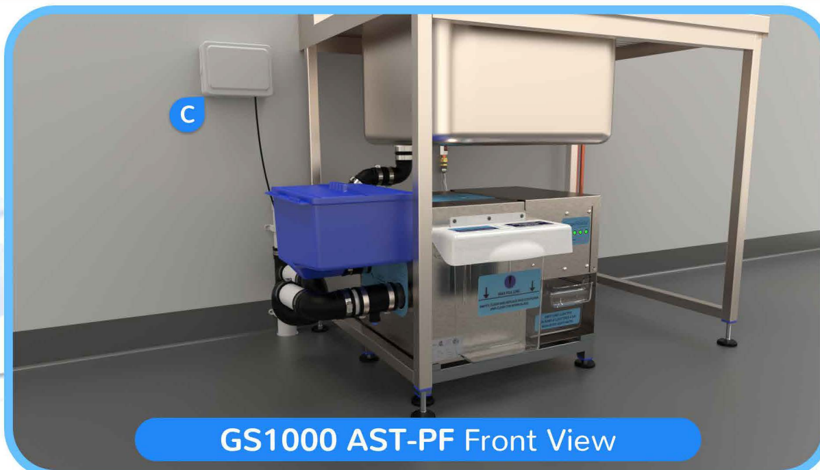
GS1000 AST-PF Front View