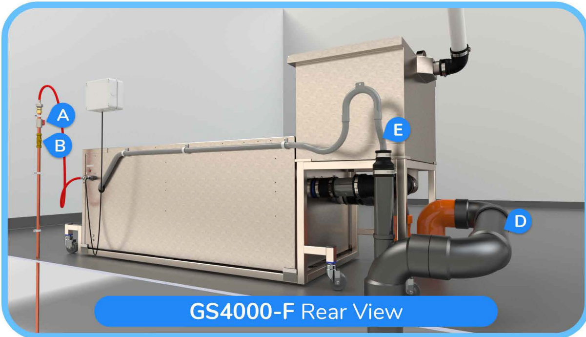
GS4000-F Rear View