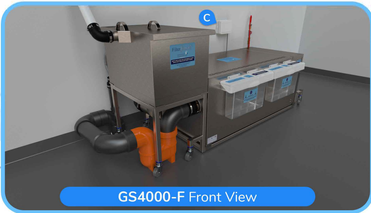
GS4000-F Front View